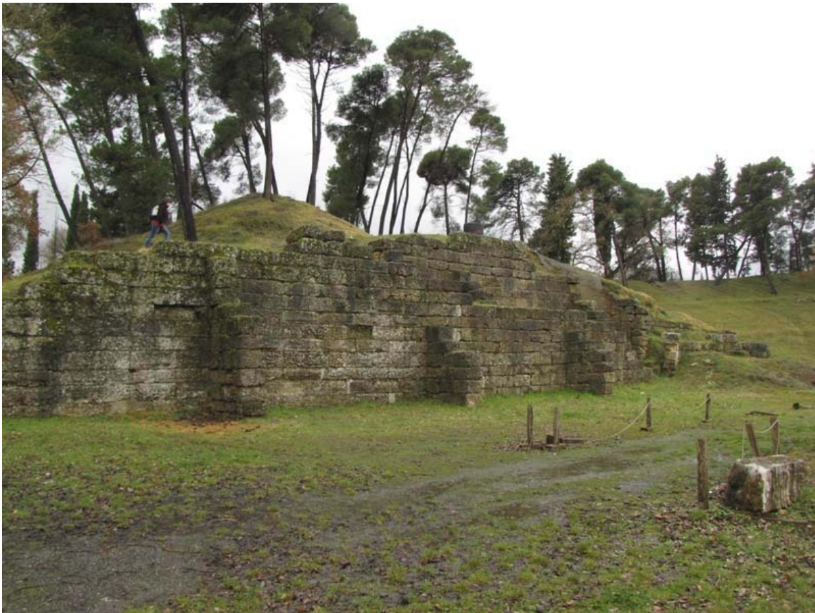
Image 7. The upper part of the eastern retaining wall.