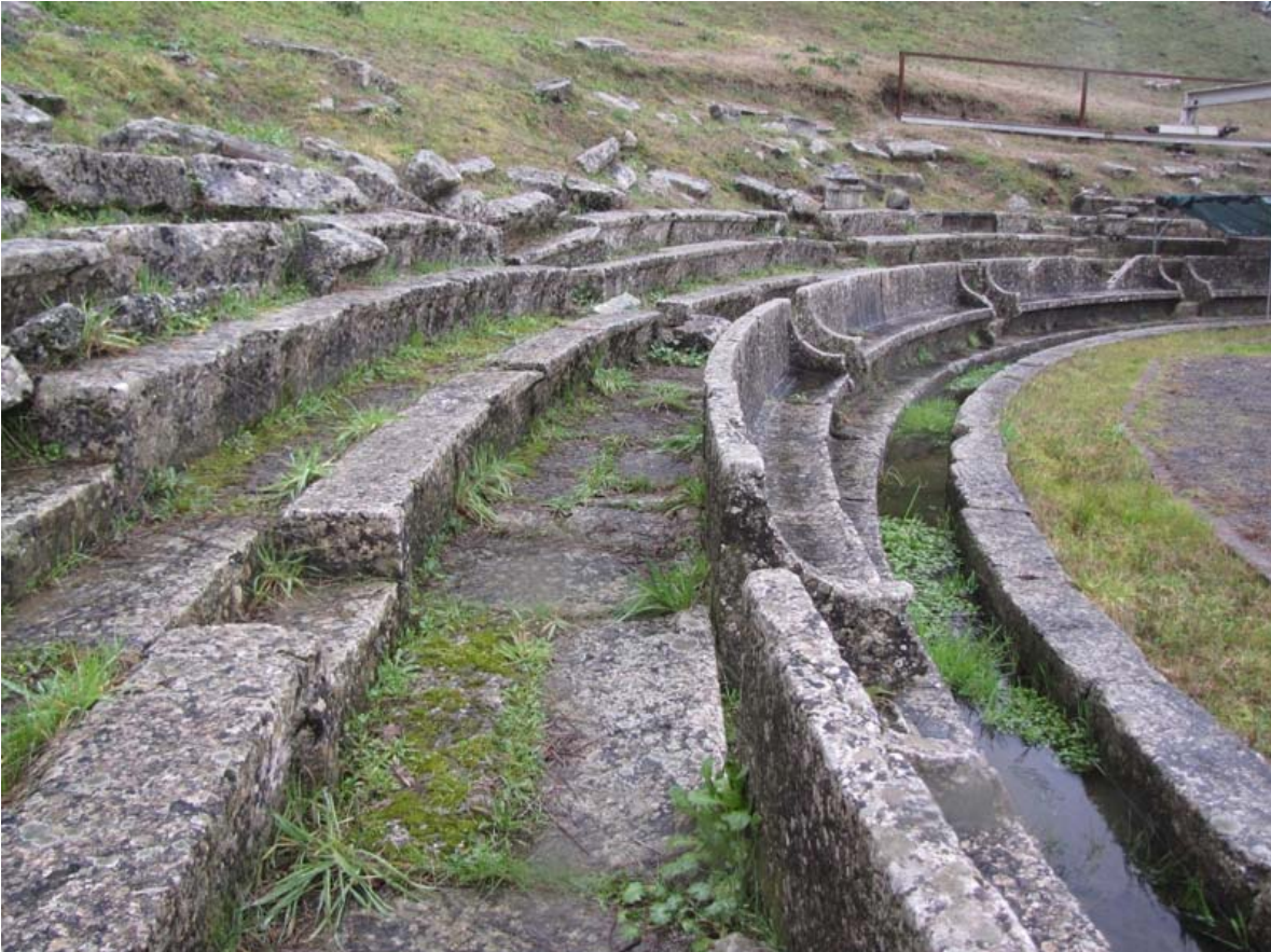
Image 28. The western half of the upper part of the auditorium.