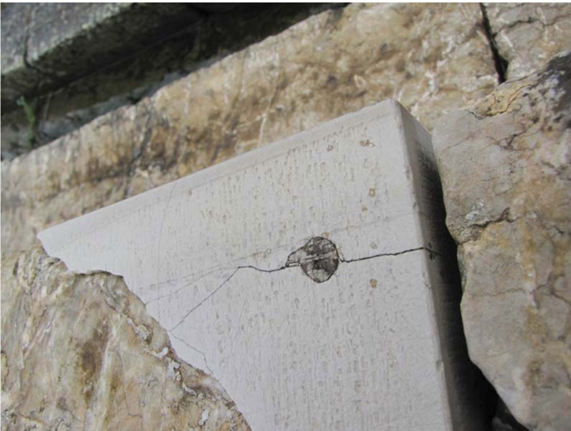
Image 27. Detail of filling.