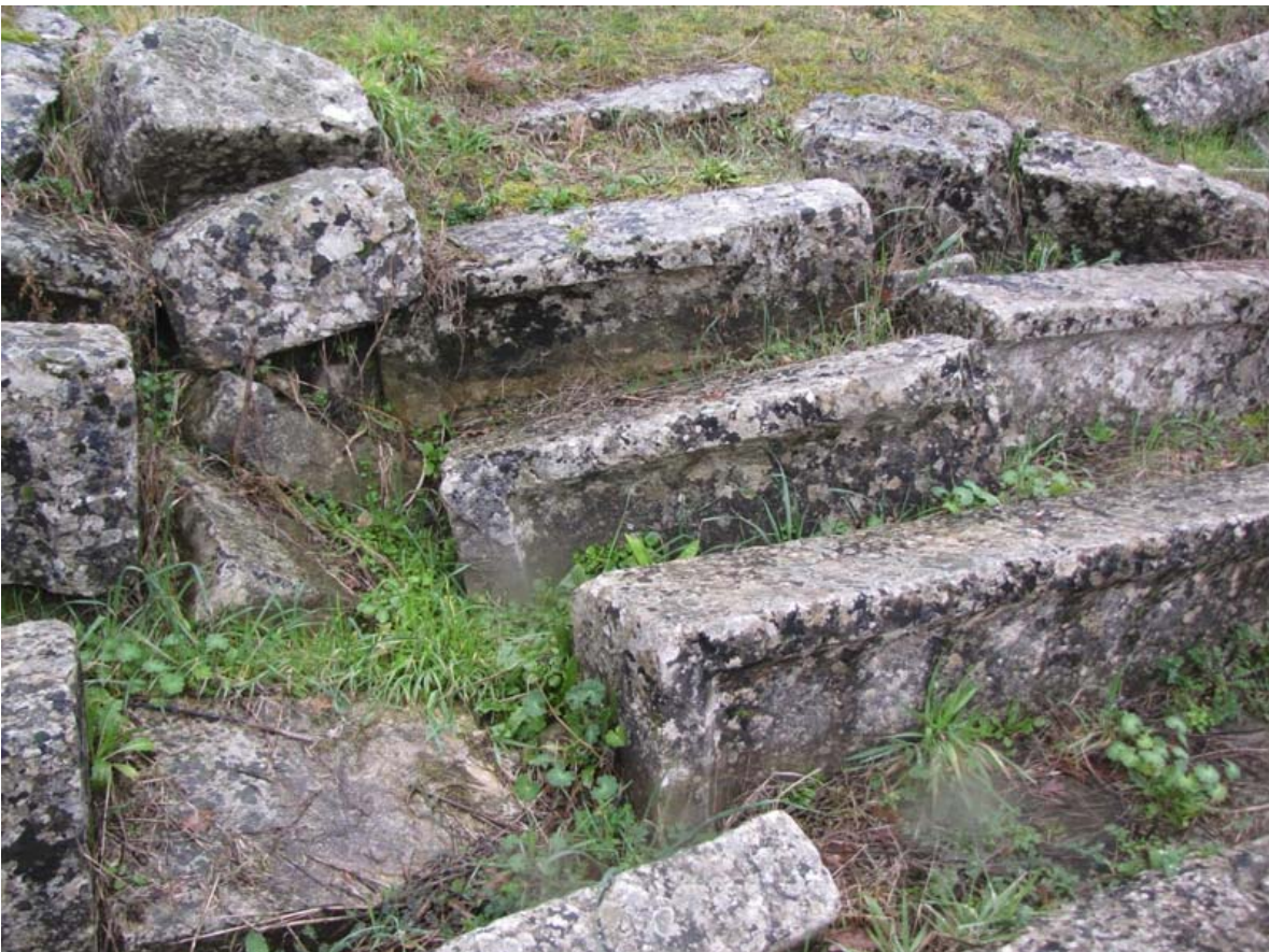
Image 29. Large deformations of benches and stairs in tier Sigma Tau (ΣΤ).