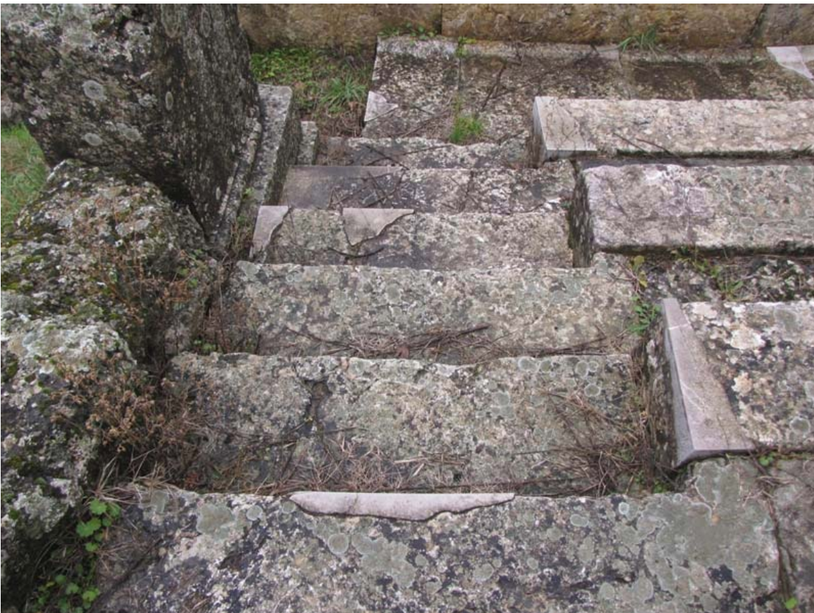
Image 25. Fillings with new stone in the western staircase.