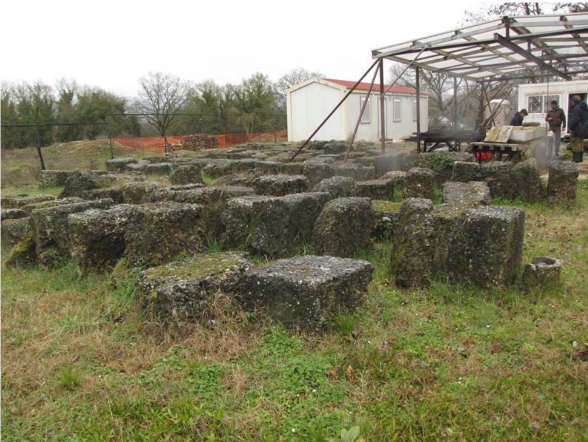
Image 10. Orderly stone plinths of the eastern retaining wall.