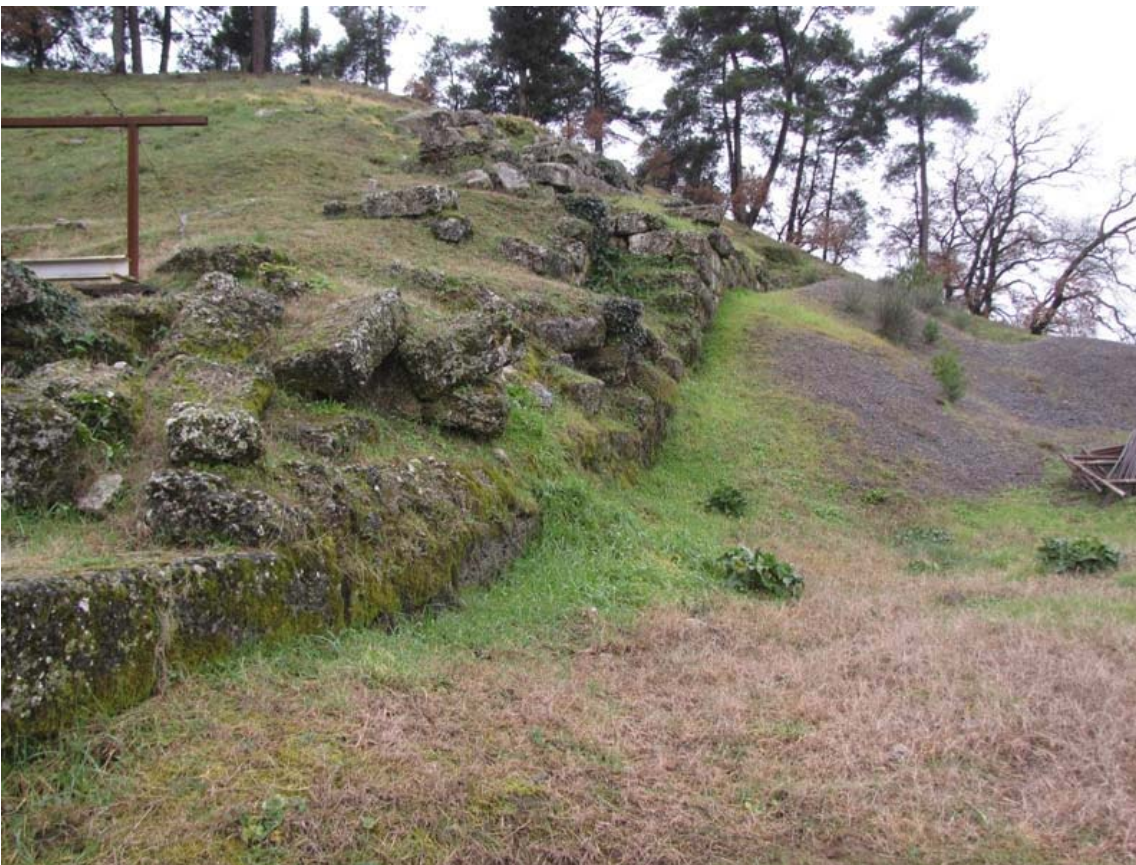
Image 13. The western retaining walls from tier A. Visible are the large deformations.