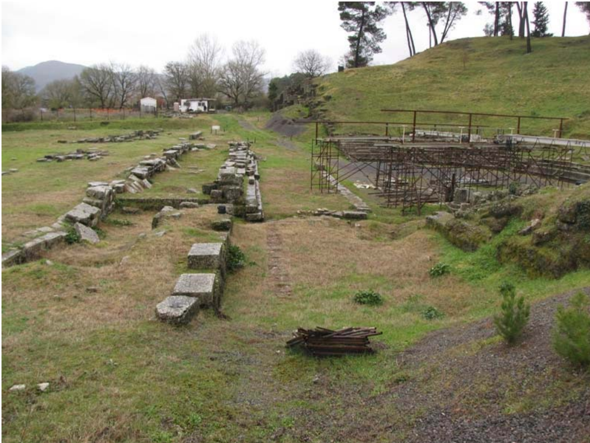
Image 34. General view of the crepis of the Thersileion and its propylon (portico).