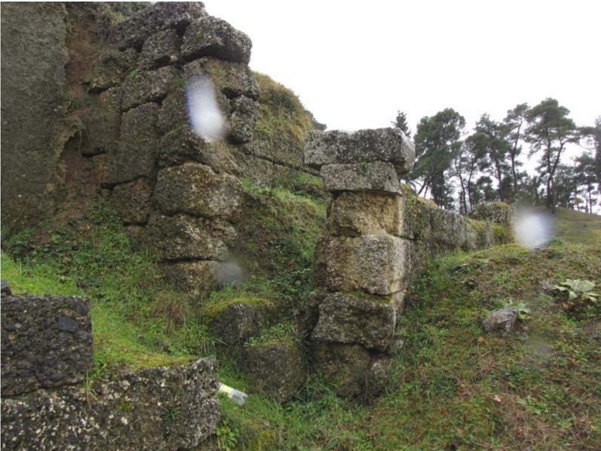
Image 9. Internal transverse wall in ramshackle condition.