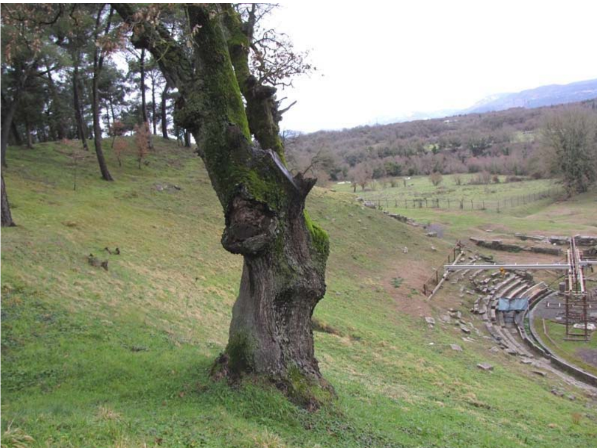
Image 31. Old pine tree in the upper part of the auditorium.