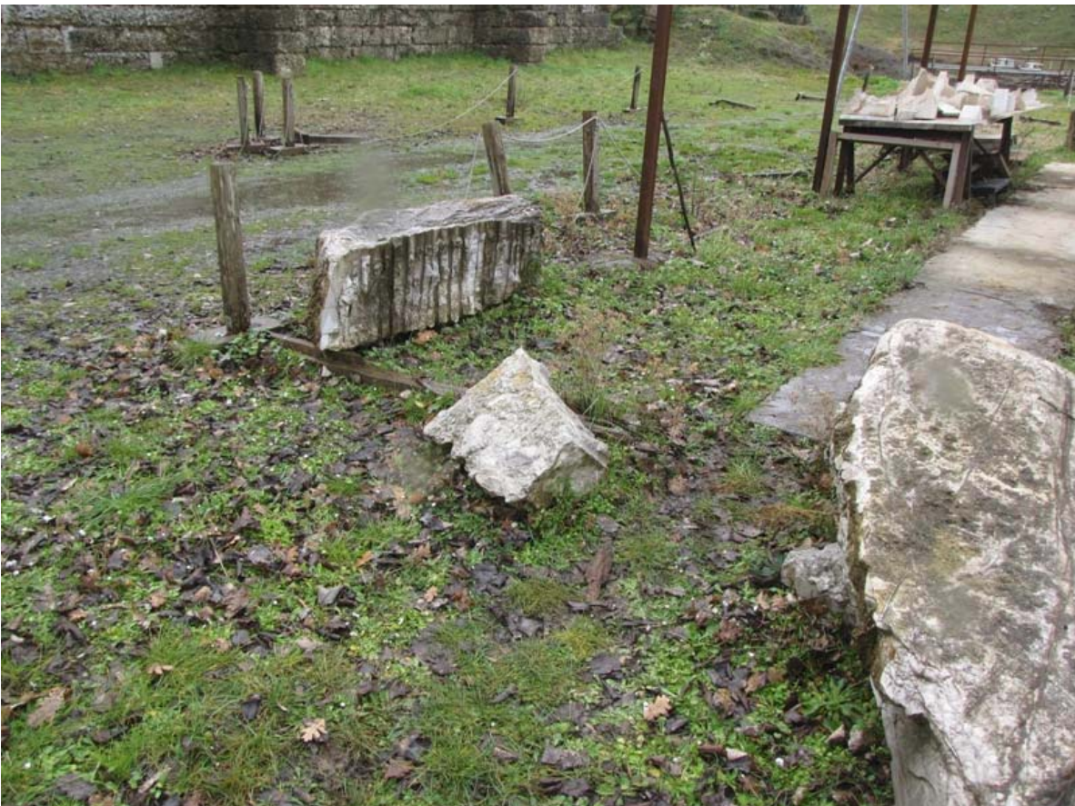
Image 33. New volumes of marble for fillings.