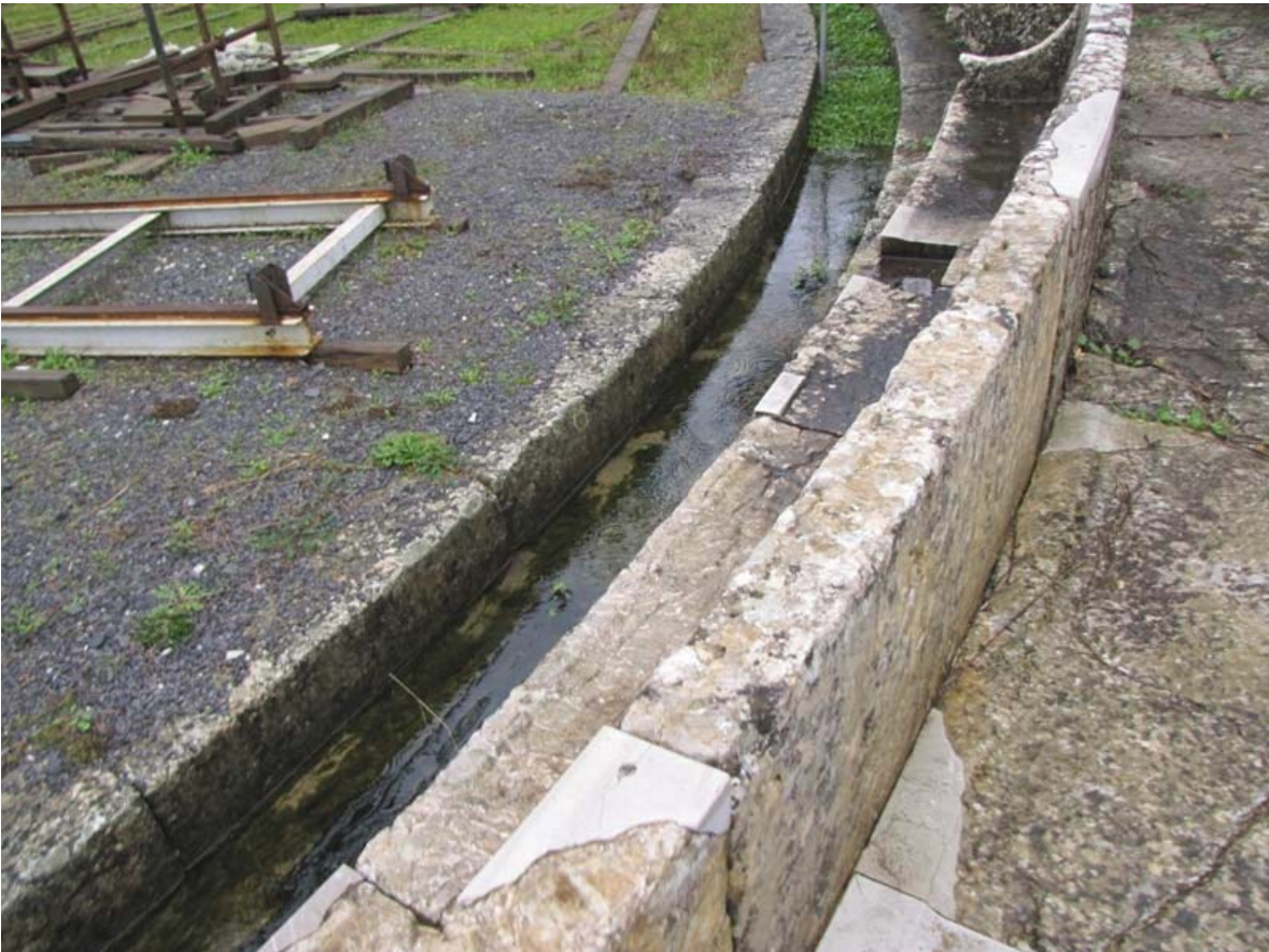
Image 26. Fillings with new stone in proedria (VIP) front seats of tier Theta ( \Theta ).