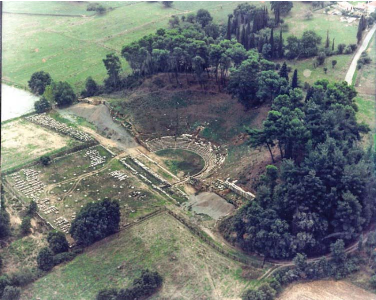
Image 5. General view of the theater with the earth fills for the protection of the retaining walls (c. 1999 before the intervention) http://www.diakopes.gr/destinations/peloponnisos/arkadia/megalopoli/?cid=43924