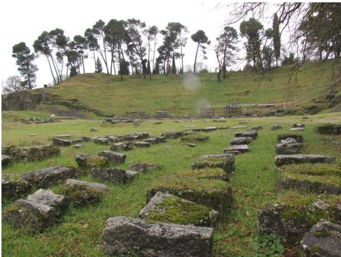
Image 1. General view of the theater from the Thersileion (under rain).