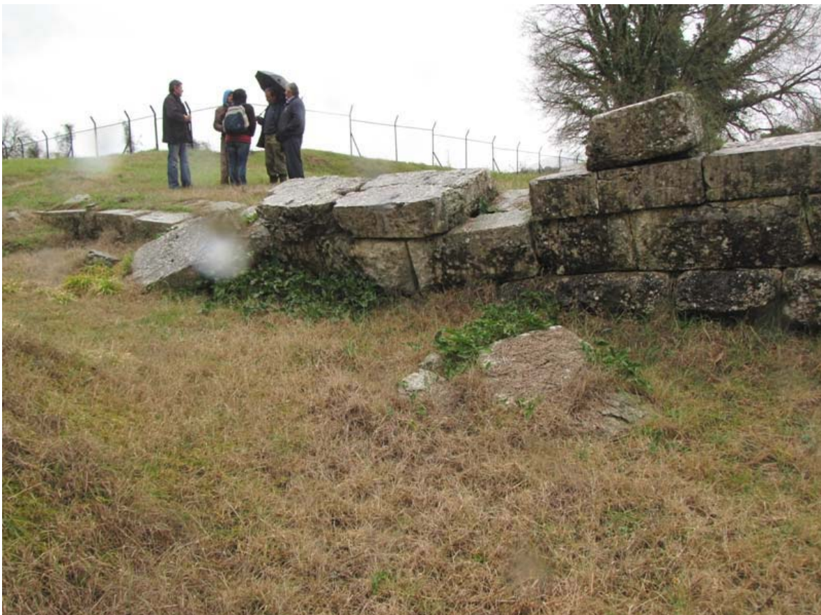
Image 35. Large deformations in the western edge of the crepis of the Thersileion.