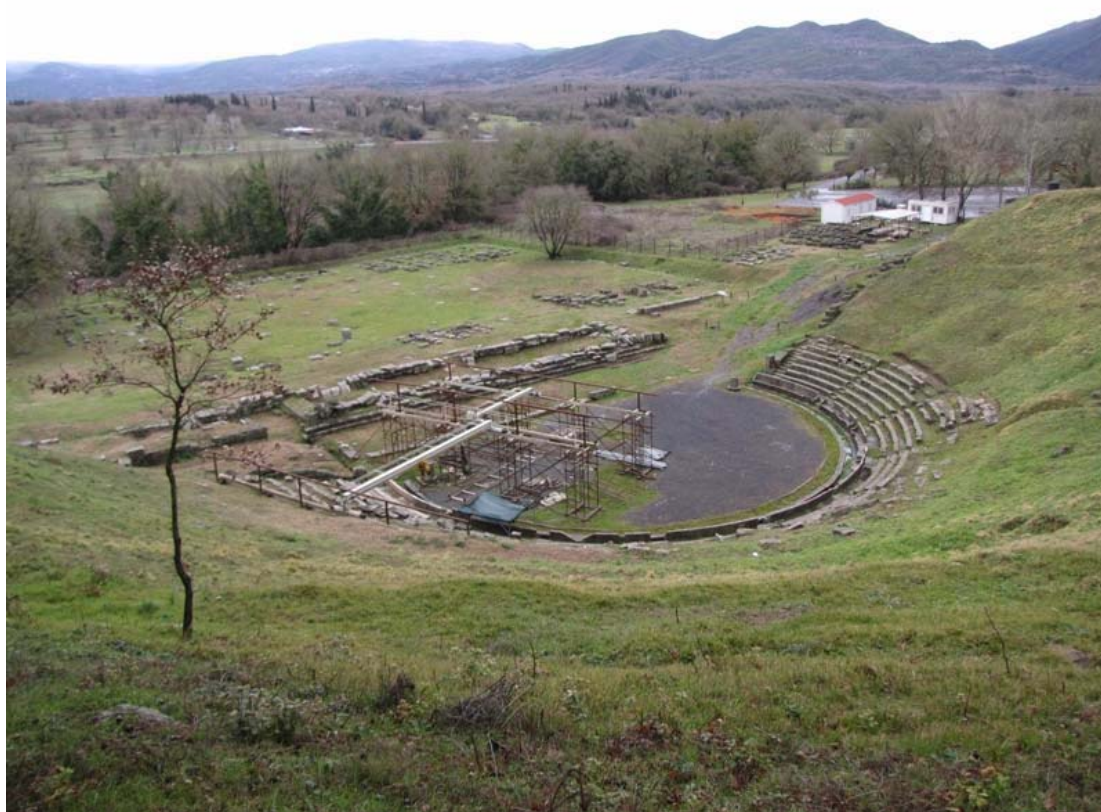
Image 4. General view of the theater from SW. Visible in the background are the worksite huts and the shelter.