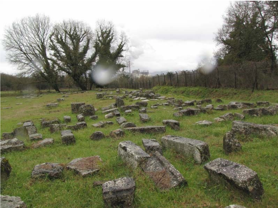
Image 32. Sorted seats in the Thersileion.