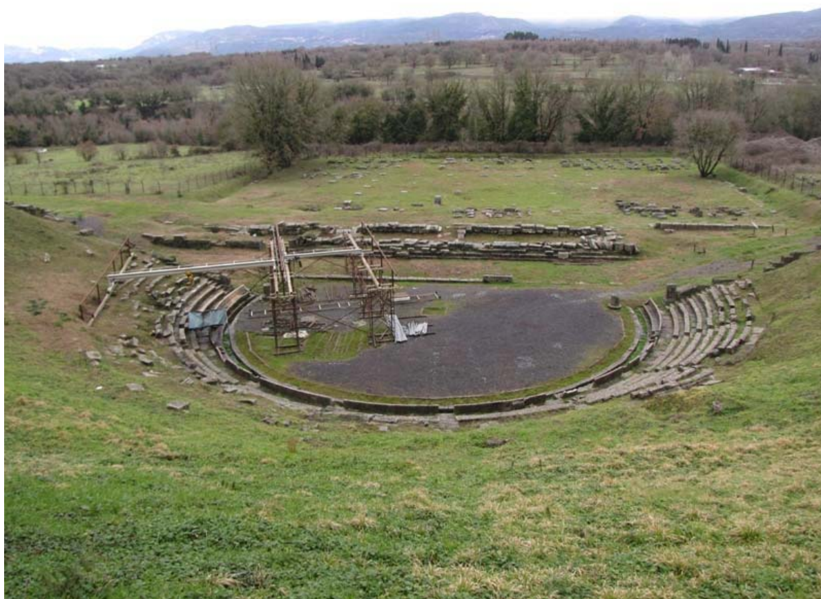
Image 2. General view of the theater from above. In the background the foundations of the Thersileion.