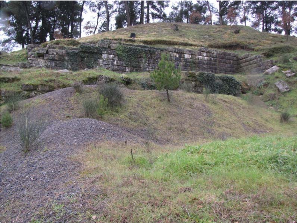
Image 12. The western retaining walls with the earth fills.