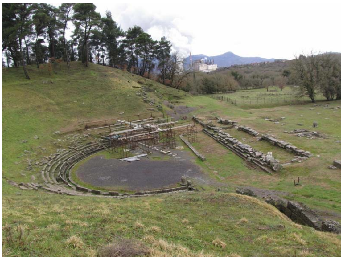
Image 3. General view of the theater from SE. Visible is the overhead crane at the western edge of the orchestra.