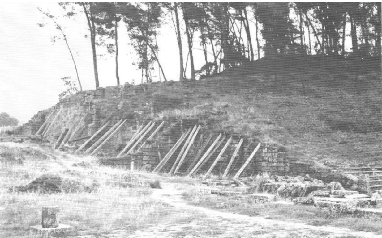
Image 6. The eastern retaining wall with the struts before the earth fills (Portelanos, Kambourakis 1993, 49).