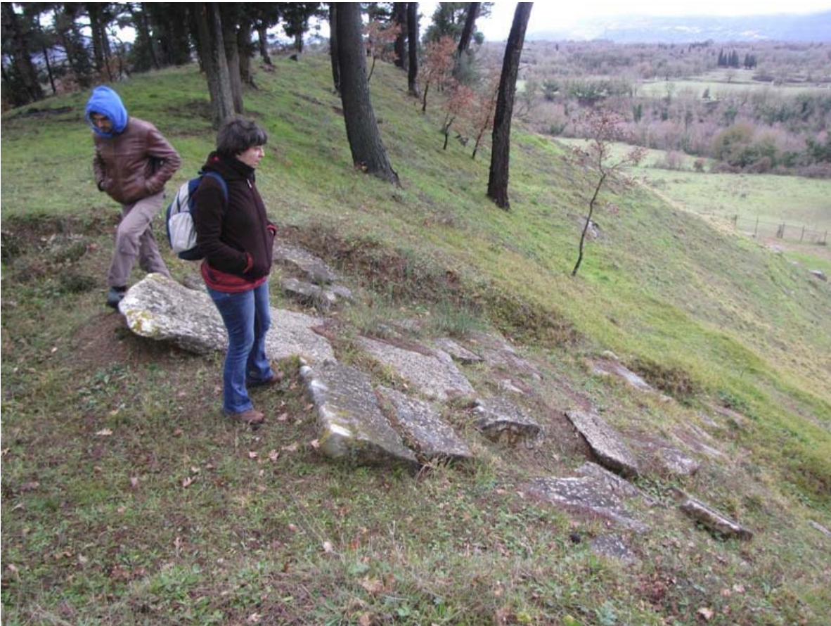
Image 30. Revealed parts of the stone auditorium at its upper edge.